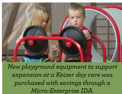
New playground equipment to support expansion at a Keizer day care was purchased with savings through a Micro-Enterprise IDA.

We all have a stake in an Oregon where everyone has access to opportunity and communities can prosper. Together, we can build and sustain the next generation's middle class and create pathways to