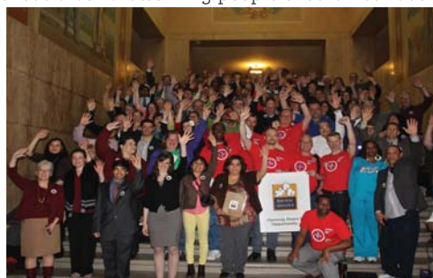
Participants from the 2013 Housing Opportunity Day stand together to show their support for safe, stable, affordable housing for all Oregonians.

to choose between paying the rent and buying food and medicine, and we know that too many Oregonians face that choice every day.