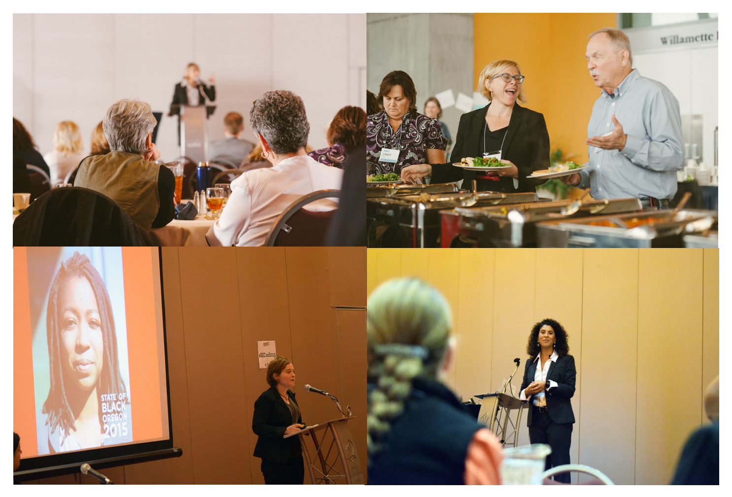
Neighborhood Partnerships creates opportunity for people with low incomes. Learn more at: NeighborhoodPartnerships.org